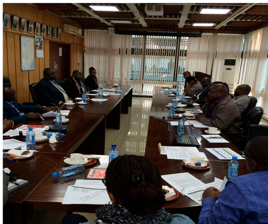
GFS TA and Training Mission in Malawi, July 25–August 5, 2016)

GFS technical working group; finalizing a new multi-year results-based management GFS work plan; deciding to publish quarterly GFS for budgetary central government; reviewing and improving recently released GFS for general government for FY 2014/15; and checking the status of ongoing projects under the East African Community Secretariat – IMF AFE GFS Capacity Development Program.