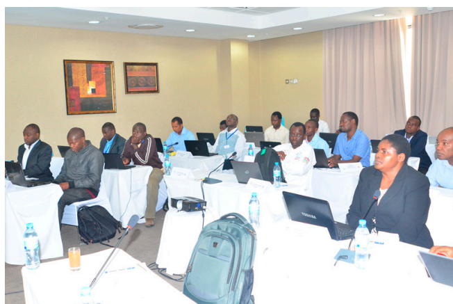
Participants listening to Ongoing presentations the training at the Regional Workshop on Macro-Fiscal Forecasting, Tanzania (August 8-18, 2016)

Macro-Fiscal Analysis: In a nine-day workshop in Arusha (Tanzania), AFE trained government officials from Ethiopia, Kenya, Malawi, Rwanda, Tanzania and Uganda in macro-fiscal forecasting (August 8-18). The workshop covered two main areas: (i) macroeconomic forecasting, which focused on advanced time-series methods for forecasting GDP, inflation and other macroeconomic aggregates; (ii) fiscal forecasting, which focused on revenue and expenditure forecasting, and the analysis of budget financing and debt. The training provided a balanced mix of theory and practice using the econometrics package EViews.