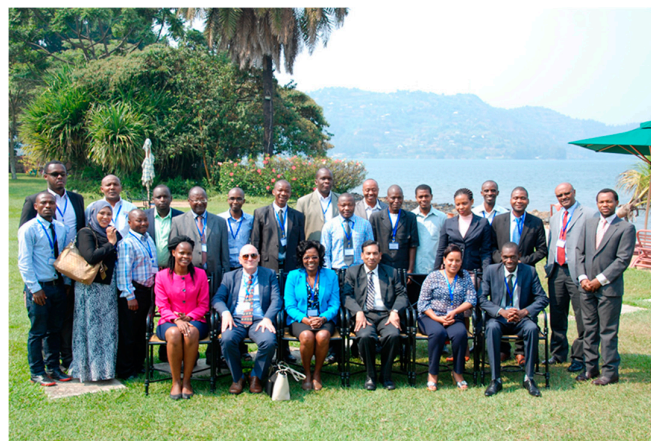
Participants at the AFE organized Regional Workshop on National Accounts, Rwanda (August 1-6, 2016)

Economic and Financial Statistics: AFE conducted a regional national accounts workshop in Gisenyi, Rwanda (August 1-6) to assist the member countries with the analysis of: (i) household income expenditure survey (HIES) data and (ii) international trade data, as part of the process of developing the relevant components of supply and use tables (SUTs). The SUTs are useful for economic analysis, as well as improving the national accounts by identifying gaps and inconsistencies at the industry and product level. Countries are expected to produce rebased GDP and 2015 SUTs by the end of CY 2017. 23 participants from Ethiopia, Kenya, Malawi, Rwanda Tanzania, Uganda and Zanzibar participated in the workshop.