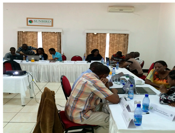
GFS TA Mission in progress, Kenya, August 8–19, 2016

engagement with Malawi on GFS; and left a draft multi-year results-based management work plan that Malawi authorities are expected to customize to fit the nation's needs. The one-week of GFS training received high score marks from participants.