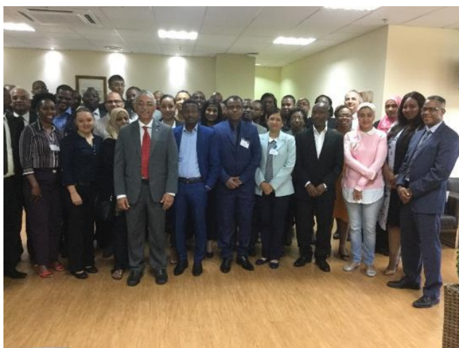
Participants in the regional regulators workshops on Basel II/III, August 21 – 25, Mauritius

Regional regulators and supervisors from Eastern and Southern Africa gathered in Mauritius to share experiences and receive training on enhancements to the Basel process, focused on recent developments relating to Basel II and Basel III. This was a joint seminar organized in collaboration with IMF AFRITAC South and the COMESA Monetary Institute. The seminar reinforced the importance of strong capital and liquidity positions that adequately cover banks' risks and contribute to financial system stability. Participants shared experiences through country presentations and interactive group discussions.