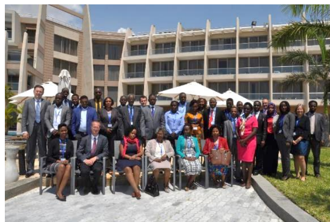
Participants in the exchange rate policy workshop, September 18-22, Dar es Salaam.

reserve adequacy, and the real exchange rate and macroeconomic policy. The course was well received by participants, who appreciated the use of recent member country data during the course. Several participants mentioned that the course had prepared them well for future discussions with IMF missions on exchange rate and reserve issues and that they would feel more comfortable challenging certain assumptions. Others mentioned that the course made them more aware of the linkages between exchange rate developments and other domestic and external economic developments.