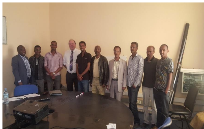
GFS Mission participants in Eritrea

Government Finance Statistics: Support was provided to Eritrea on developing a public sector institutional table and chart of accounts that meets the GFS Manual 2014 standard.