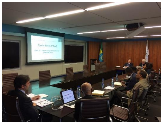
Participants in the cash basis IPSAS workshop in Ethiopia

Public Financial Management: Support was provided on PFM reform strategy, treasury single account (TSA) implementation and improvements in financial reporting. The mission made recommendations for improving the scope and early finalization of the PFM reform strategy. On the consolidation of government banking arrangements and implementation of TSA, the mission suggested a sequenced approach in gradually extending its coverage. The mission undertook a gap analysis with respect to cash basis international public sector accounting standards (IPSAS) and provided detailed guidance on prioritized activities to address identified gaps. The mission also delivered a workshop on cash basis IPSAS for senior officials of the Ministry of Finance and Economic Cooperation and Office of the Auditor General.