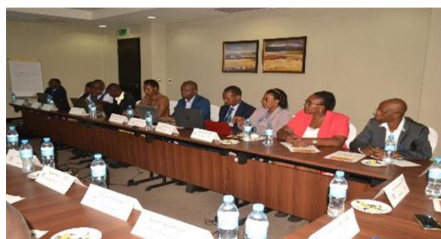
Participants in the joint EAC/AFE workshop on PFM in Tanzania, January 2018.

AFE and FAD supported the EAC workshop on PFM harmonization among partner states. This was the sixth annual workshop and was attended by all partner states including South Sudan that has recently joined the EAC. The workshop reported progress with the PFM reporting practices and the legal frameworks and noted improvements in the fiscal and statistical reporting practices. Major outcomes from the workshop included partner states' agreement on submission of updated PFM action and convergence plans to the EAC Secretariat by May 2018.