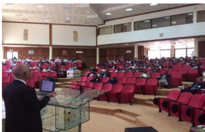
Workshop participants during the mission on strengthening annual financial reporting in Kenya, December 2017.

Public Financial Management: Kenya is improving the coverage and quality of its annual financial reporting. A significant step is the publication of the unaudited consolidated financial statements as required by the PFM Act. An AFE mission assessed the consolidated financial statements for FY 2015/16 that covers the budgetary central government and incorporates tax and other revenues and disclosures on public debt. The mission provided assistance on the presentation of budget information in the financial statements and on the planned adoption of accrual accounting.