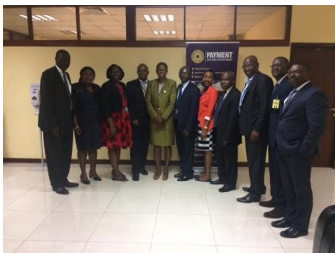
Ethiopia, Kenya, Rwanda and Uganda delegates at the BOG.

Financial Market Infrastructures: Four delegates from Ethiopia, Kenya, Rwanda, and Uganda participated in a one-week professional attachment to the Bank of Ghana in November. Reflecting their strong interest and commitment, Kenya and Uganda self-funded an additional four persons bringing the total delegation to eight. Participants identified several implementable actions for their respective jurisdictions based on the observations and lessons learnt in Ghana, and have requested TA to support these efforts in FY19 and beyond.