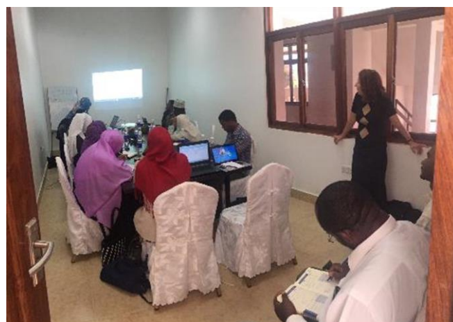
Participants in a mission on updating financial programming framework, Zanzibar, December 2017.

framework. A second workshop was run concurrently to provide training on fiscal policy and revenue forecasting for the new Department of Fiscal and Financial Policies in the ministry.