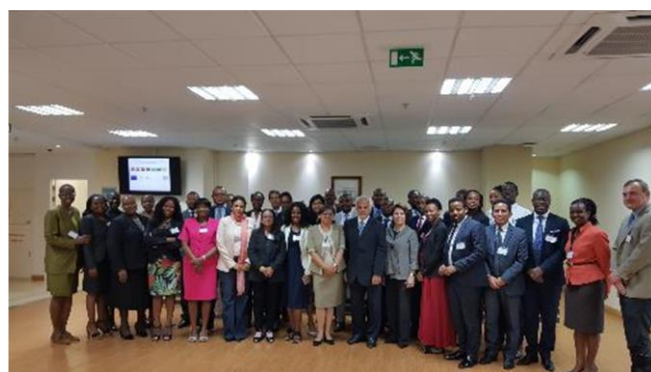
Participants in the workshop on legal aspects of the national payments system in Mauritius, November 2017.

Financial Market Infrastructures: AFE, in collaboration with IMF AFRITAC South and the IMF's Legal Department, conducted a regional workshop on the legal aspects of the national payments system to strengthen compliance with Principle 1 (Legal Basis) of the CPSS-IOSCO Principles for Financial Market Infrastructures. The workshop gave guidance on international good practice to enhance the work of the legal professionals tasked with advising on, drafting, or amending the relevant NPS laws.