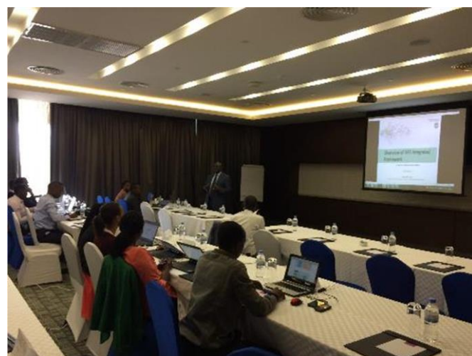
An AFE mission on strengthening coverage of the national budget, Rwanda, November 2017.

(IPSAS). The review provided feedback to the authorities with recommendations on phasing the implementation, defining intermediate milestones, starting key activities early (e.g., valuation of nonfinancial assets), and on careful planning and close monitoring of activities to achieve successful compliance with accrual based IPSAS by 2022/23.