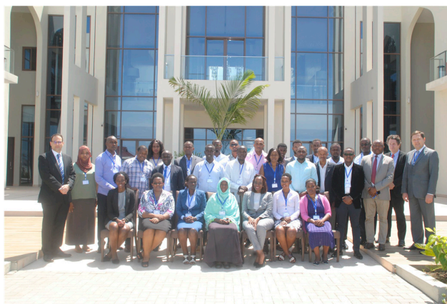
Participants in the capital flows workshop (Zanzibar, December 2018)

AFE together with the IMF Institute for Capacity Development organized a 5-day regional course on managing capital flows. The course covered the determinants of capital flows and the link between these flows and economic growth, macroeconomic volatility, and crisis risk. It also discussed capital account management tools and how they relate to financial regulation and exchange rate intervention. Using course material, the participants debated policy options available to reap the benefits of capital market integration while minimizing and mitigating its possible adverse effects.