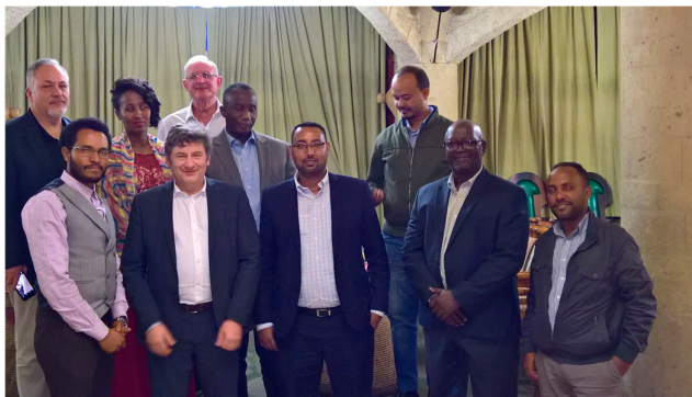
FAD and AFE staff visit to Ethiopia

under the Revenue Mobilization Thematic Fund project and AFE program.