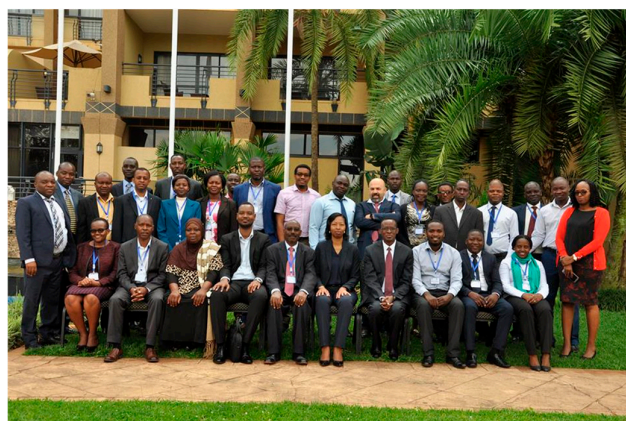
Participants in the PSDS workshop (Kigali, November 2018)

Government Finance Statistics: A regional workshop was held on the compilation and dissemination of public sector debt statistics (PSDS). The workshop aimed to finalize the EAC's guidelines on the development of GFS and data revision policies on PSDS; and refine the guidelines on establishing an inventory of methods, procedures and sources used for the compilation of GFS and PSDS. The participants shared experience on best practices in PSDS compilation.