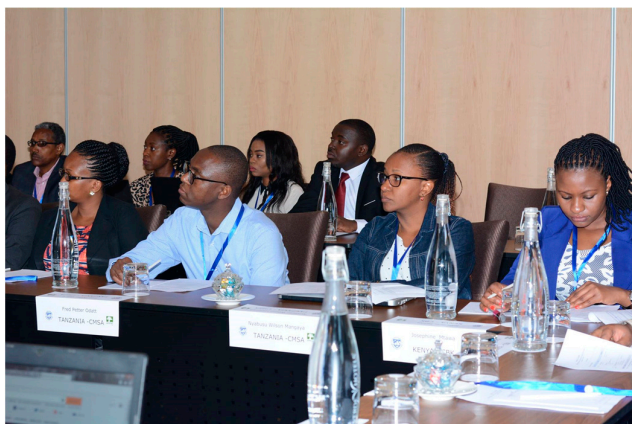
Participants in the cyber security workshop (Zanzibar, November 2018)

Financial Sector Supervision and Regulation: AFE in collaboration with the IMF Monetary and Capital Markets Department delivered a regional training workshop on building cyber resilience in East Africa and enhancing information communication technology (ICT) supervision. The workshop covered emerging cyber security trends, overview of regulatory frameworks internationally, cyber risk supervision and crisis management, and elements of good cyber regulatory practice in developing markets.