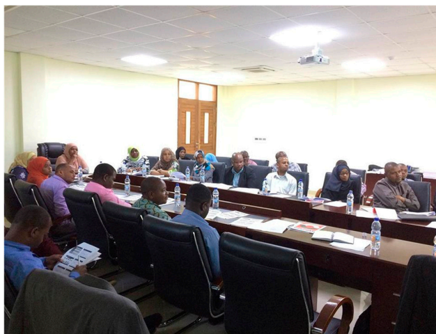
Participants in the PFM mission (Zanzibar, November 2018)

Public Financial Management: Support was provided on cash management and in-year reporting practice. The mission provided advice on further improvements on formalizing the cash management function, refining cashflow forecasting templates, reconfiguring the IFMIS, implementing the financial regulations (currently in draft format), improving reporting practices, and enhancing the format and content of in-year reporting using new reporting templates. The mission also delivered a workshop for officials of the MoFP, selected ministries departments and agencies (MDAs) and regional governments on cash flow forecasting and in-year reporting.