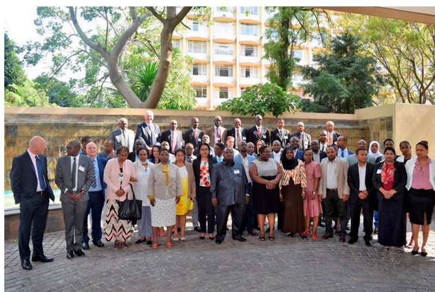
Participants in the IPSAS workshop (South Africa, January 2018)

AFE in collaboration with AFRITAC South, the Common Market for Eastern and Southern Africa (COMESA) Secretariat and the Southern African Development Community (SADC) delivered a five-day workshop on public sector accounting and reporting. Member countries are at different stages in implementing international accounting standards with the majority using a modified cash, or modified accrual basis but there is a general desire to move towards full accrual accounting in accordance with International Public Sector Accounting Standards (IPSAS).