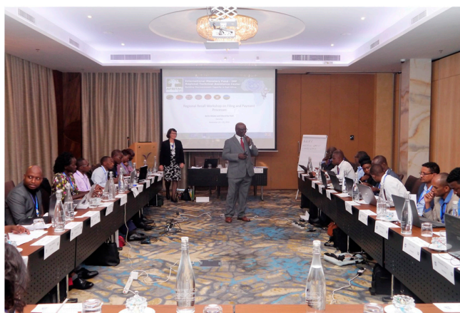
Participants in the effective filing workshop

processes to suit their various situations. This was a follow-up workshop to the one held in September 2018 on the same topic. The workshop participants shared progress on their country action plans and then updated their plans after lessons learned from their peers (success, challenges, solutions etc.). The workshop provided technical skills on improving the effectiveness of filing and payment processes and the translation of key lessons into practical work.