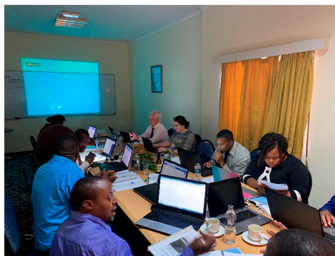
Participants in the working sessions of the SEO mission

Public Financial Management: A mission delivered an annotated outline for a consolidated state-owned enterprises (SOEs) report covering 28 commercial SOEs and developed outlines for five high risk case studies. These outputs provide a strong platform for publication and submission to the National Parliament in March 2020. The consolidated SOEs report outline was streamlined and enriched from the recommendations in the previous AFE mission in June 2018. All figures and tables in the report have been programmed in the accompanying tool and are drawing the financial information from the relevant financial statements and related notes, while the non-financial information is coming from the individual SOE performance management plan and budgets.