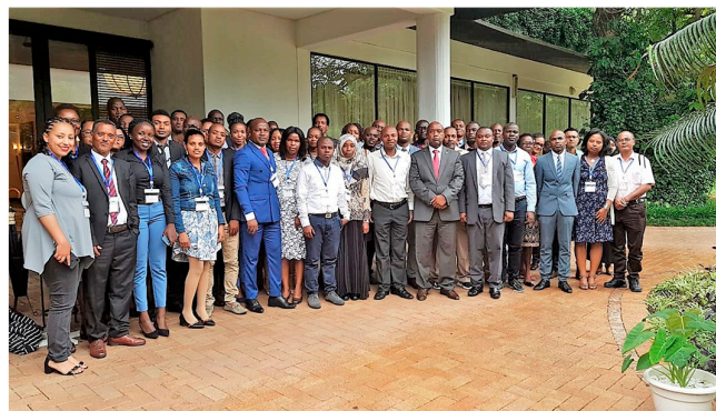
Participants in the GDP compilation workshop

Real Sector Statistics: AFE in collaboration with AFRITAC South and the Common Market for Eastern and Southern Africa (COMESA) conducted a regional training on volume and price measures in GDP compilation. The workshop focused on statistical techniques including the choice of index formula; the inclusion of quality and compositional changes in volume measures; and acceptable methods in deflation of goods and services to produce volume GDP growth rates and deflators. Participants were able to identify weaknesses in their current compilation practices and possible areas of improvement.