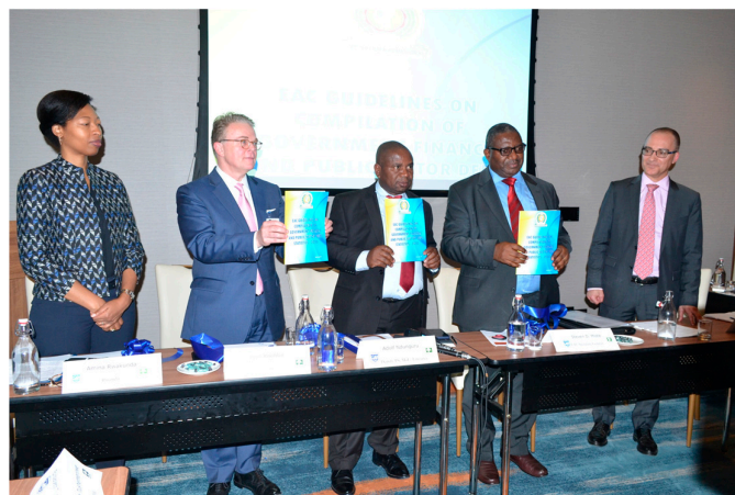
Launching of the EAC Guidelines on GFS/ PSDS compilation

Government Finance Statistics: The EAC Secretariat reviewed the progress made in improving the capacity to compile the fiscal and debt data necessary for the monitoring of macroeconomic convergence towards the East African Monetary Union (EAMU). The EAC member countries, with support from AFE, concluded and launched compilation guidelines on fiscal and public debt statistics. The guidelines customize the latest compilation practices and methodology (GFSM 2014) to the EAC context to facilitate comparability regionally while remaining consistent with international standards.