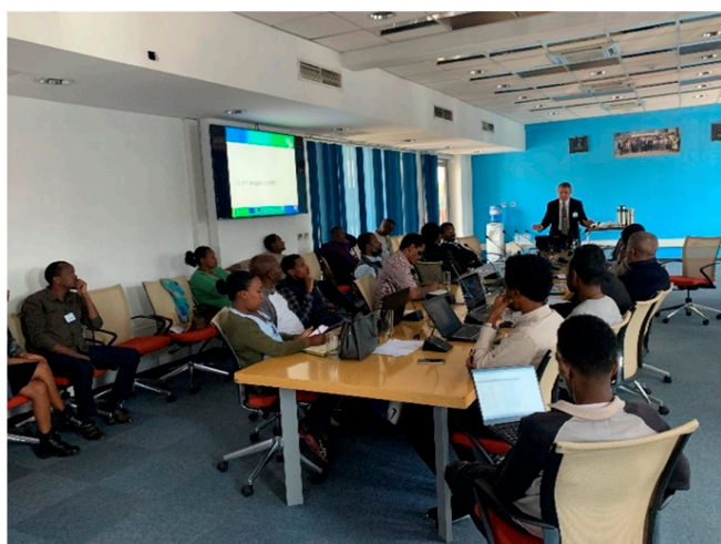
Participants in the PPP fiscal risks training

Public Financial Management: Support was provided to Ethiopia to enhance fiscal risk management of the emerging public-private partnership (PPP) project portfolio. Training was delivered for technical officials from the PPP Directorate and the Debt Management Department in the Ministry of Finance and technical staff from Ethiopia Electric Power and Ethiopia Roads Authority through a series of presentations, group discussions and a hands-on practical session on the use of the PPP-Fiscal Risk Assessment Model (PFRAM). The mission developed a simple PPP project fiscal risk checklist for the authorities to populate to support the update of the fiscal risk register and fiscal risk statement.