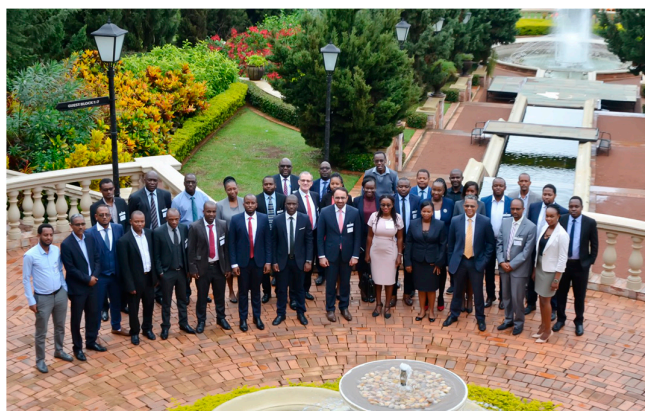
Participants in the macroprudential supervision workshop

Financial Sector Supervision and Regulation: A regional workshop was held for banking, securities and insurance supervisors on strengthening macroprudential supervision and its implications for stress testing and the greening of the financial systems. During the workshop, participants shared information on the status of macroprudential supervision in their respective countries and worked on stress testing exercises across the three sectors, banking, insurance and securities.