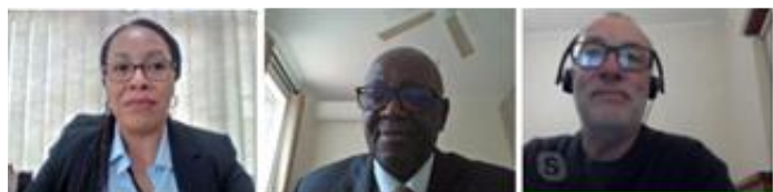
Mission team members working remotely on Eritrea

Further support was provided to the IRD on developing explanatory notes for the draft laws. The IRD was advised to develop specific explanatory notes in line with any changes that will be made in the draft articles; and when they are enacted into law, to use the explanatory notes to develop staff training and education products.