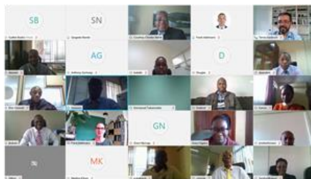
Group photo for the cyber security webinar

Financial Sector Supervision and Regulation: Capacity was built through a series of regional webinars focusing on the implementation of the simplified solvency II approach to insurance supervision and the sharing of IMF notes on insurance supervision, banking supervision and cybersecurity.