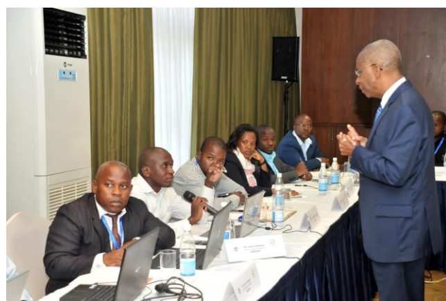
Workshop on Improving GFS Quality and Expanding the Guidelines, Uganda, November 28 – December 2, 2016.

Government Finance Statistics: AFE conducted a Workshop in Uganda entitled “Improving GFS Quality and Expanding the Guidelines.” The workshop, which had 16 participants, featured sessions on GFS quality that focused on vertical and horizontal quality checks within a GFS Manual 2014 framework. There were sessions that assessed countries’ compliance in reporting on taxes and grants as outlined in the EAC Guidelines on compilation of government finance and public sector debt statistics. In addition, the workshop featured efforts to prepare three new chapters for the Guidelines: “Debt,” “Public Private Partnerships” (PPPs), and “Above-and Below-the-Line Transactions” chapters.