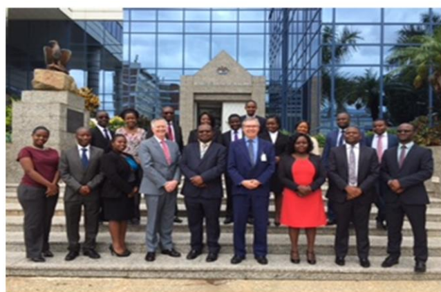
Mission on enhancing consolidated supervision and domestic systemically important banks, Malawi, January 30, 2017

Financial Sector Supervision: The Reserve Bank of Malawi (RBM) received support to enhance its supervisory framework for consolidated supervision and domestic systemically important banks (D-SIBs). This mission was predominantly aimed at providing training to the bank supervisory staff on financial sector supervision and regulation; over 30 participants attended the five-day training sessions. The mission also assisted the RBM in developing its D-SIBs supervisory framework.