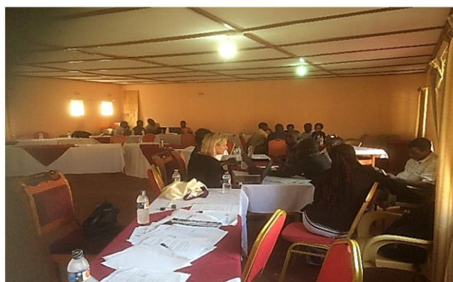
Mission on strengthening medium-term expenditure framework, Malawi, January 18 – February 2, 2017

Public Financial Management: Support was provided to strengthen its medium-term expenditure framework (MTEF). The mission also assessed the progress made since the adoption of program-based budgeting (PBB) in FY2016/17. The mission stressed the significance of the MTEF for fiscal consolidation and the successful implementation of PBB. It also made recommendations to make the MTEF more effective and proposed a sequenced implementation of the PBB.