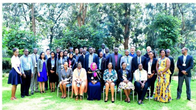
Workshop on Strengthening Institutions for Public Investment, Rwanda, November 28 – December 2, 2016

Public Financial Management: A 5-day regional workshop on strengthening institutions for public investment management (PIM) was organized in collaboration with AFRITAC West 2 in Rwanda, and was attended by 47 participants from 13 countries. The participants completed a PIM self-assessment which revealed common challenges across the region. The overarching issues identified during the workshop include: the need for common guidance in the PIM process; identification of specific roles for institutions; applying appropriate checks and balances; and ensuring the institutional inter-dependence in the investment process. Participants concluded that skills in PIM are key to the reform. Further, systems for PIM should be robust and transparent; enacted laws should be requisite and functional. Ultimately, PIM reform and success will depend on political leadership, fiscal discipline, respect for rule of law; and an accountability framework.