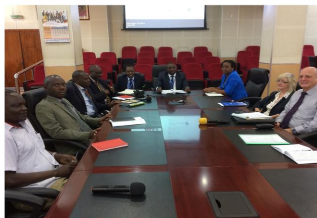
Mission on management and prevention of government expenditure arrears, Uganda, January 9 – 20, 2017

Public Financial Management: A mission assisted in implementing the TSA and strengthening cash management in Uganda. Uganda has made progress with the consolidation of government cash by establishing TSA arrangements covering the central government, and is progressively extending it to local government operations. Consistent with the advice provided by a previous mission, the Cash Management Guidelines have been approved. The mission also provided guidance in defining the cash resource pool that will facilitate the development of cash flow forecasting model and enable efficient use of government cash resources and effective budget execution.