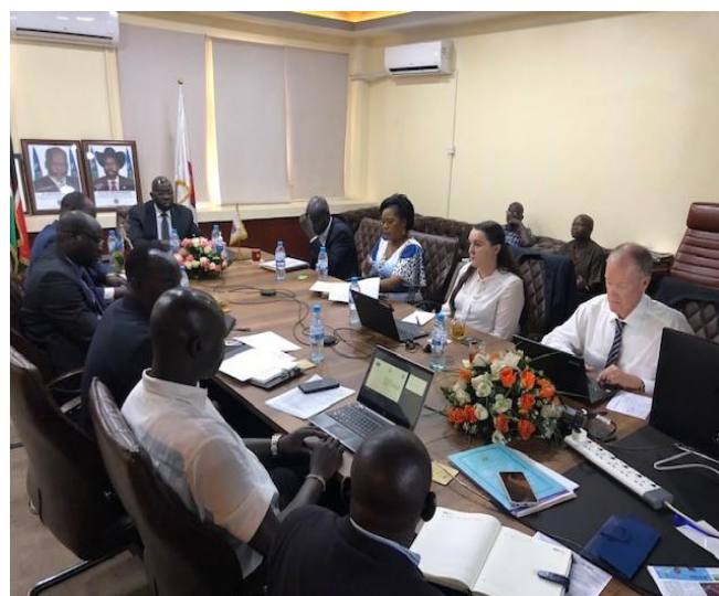
Ministry of Finance officials and AFE team

and to support the Cash Management Unit (CMU) to develop the preliminary cash plan for FY 2022/23. The mission provided hands-on technical assistance, including: (i) hands-on guidance on how to analyze and compile the government bank accounts preparing for TSA implementation; and (ii) preliminary annual cash plan on monthly basis for FY 2022/23 was developed by the mission together with the CMU. The mission focused on the techniques for quickly updating the cash plan, even with preliminary outturns/actual figures. The FY 2022/23 preliminary cash plan was presented by the CMU to the Cash Management Committee (CMC) for further action.