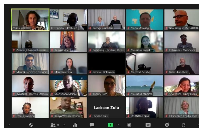
Participants at the joint workshop on fundamentals of sound central bank communication and modernizing central bank communication

Forecasting and Policy Analysis System: As part of the capacity building program at the regional level AFE, AFRITAC South (AFS) and AFRITAC West 2 (AFW2), jointly organized two workshops on monetary policy communication: “ Fundamentals of sound central bank communication ” and “ Modernizing Central Bank Communication ”. The seminars targeted 27 central banks in the East, South, and West regions of Africa. The two seminars were customized in accordance with the central banks level of sophistication in terms of communication and, to some degree, according to their various monetary policy regimes. The seminars covered a broad range of communication aspects ranging from transparency and accountability, use of plain language, and standard features of monetary policy communication. For communication to be effective it's important to know the media landscape, to nurture relationship with the media and to evaluate media impact. Thus, various aspects of media were another important topic of the seminars. The seminars were a mix of lectures, group sessions, panel discussions and country presentations.