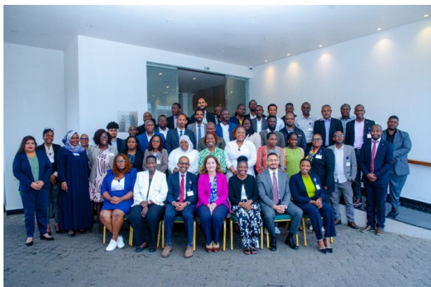
MTFF Workshop. Arusha, Tanzania. September 1 - 5, 2025

Public Finance Management: Treasury Single Account (TSA) and Budget Control. AFE hosted a regional workshop in Arusha, Tanzania focused on sharing experiences and developing strategies for TSA implementation. The workshop was attended by 24 participants from Ethiopia, Kenya, Malawi, Tanzania (including Zanzibar), and Uganda. South Sudan, Rwanda.