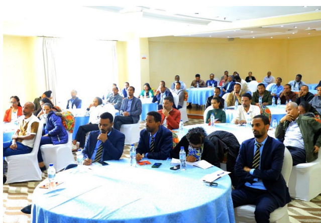
Participants during the Ethiopia Trade Facilitation Agreement training

Revenue Administration: The technical capacity of the Ethiopian Customs Commissions was strengthened to meet World Trade Organization Trade Facilitation Agreement customs obligations.