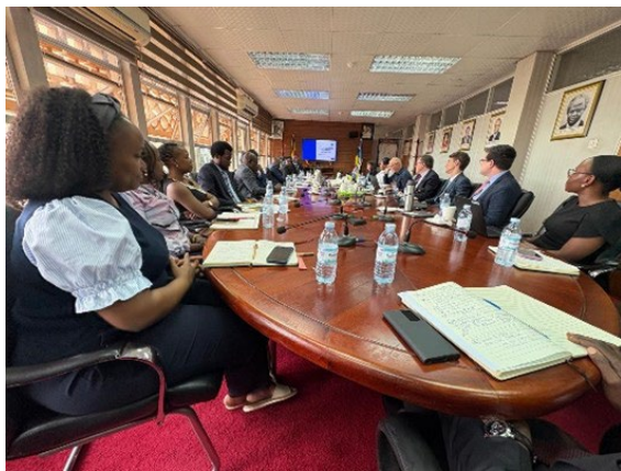
Uganda Ministry of Finance and IMF and AFE Mission Team

Macroeconomic Framework: A scoping mission to Uganda assessed macroeconomic forecasting and policy analysis systems, reviewed tools, and agreed on a project action plan. The Ministry of Finance (MOFPED) seeks a more adaptable macroframework for medium-term policy analysis, while the National Planning Authority requires an improved FPP-type forecasting tool.