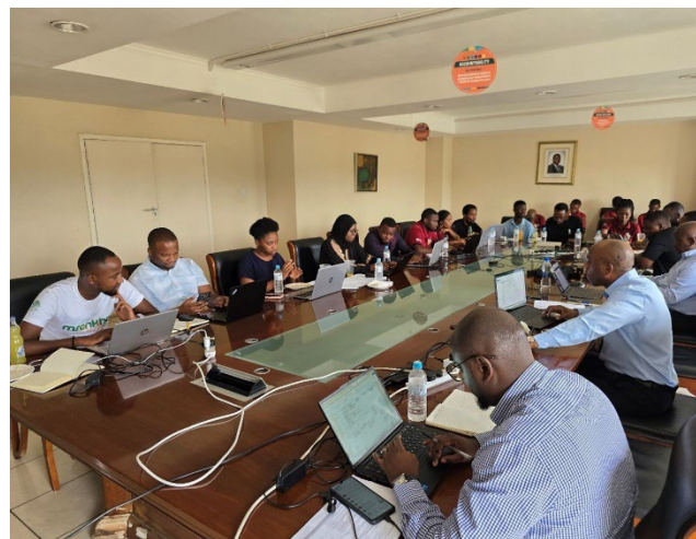
Participants during the Malawi customs valuation mission in Blantyre, Malawi

Revenue Administration: The Malawi Revenue Authority (MRA) Customs and Excise Division received targeted support to strengthen its customs valuation capacity. The initiative focused on assisting MRA in reviewing and improving its valuation practices to ensure compliance with international best practices established by the World Trade Organization and the World Customs Organization.