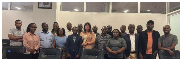
Ministry of Finance staff with AFE team

Government Finance Statistics: Tanzania expanded Government Finance Statistics coverage to include the fully consolidated general government. It also resumed quarterly debt statistics reporting to the joint IMF/World Bank database with AFE's support. These improvements enhance transparency, align with international reporting standards, and strengthen the country's capacity for sound fiscal analysis.