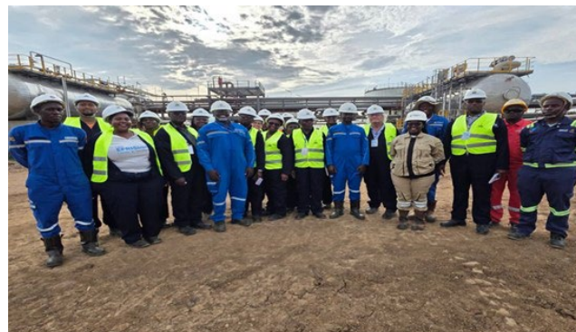
AFE advisors and URA Customs Officers during a field visit to Tilenga Oil fields, Western Uganda

addressing sector-specific risks and complexities. Following the workshop, a two-day field visit to the Albertine oil fields—Kingfisher and Tilenga projects—provided firsthand insights into operations and internal controls, informing SOP refinement and implementation. The mission was jointly delivered with the new AFE-based EI Revenue Administration Resident Advisor, showcasing AFE's collaborative approach and leveraging resources from different funding programs to support member countries effectively.