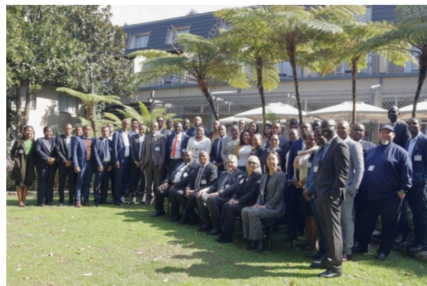
ISORA workshop. Johannesburg, South Africa. August 18 - 22, 2025.

the world using questions and definitions agreed on by four international organizations: the Inter-American Center of Tax Administration; the International Monetary Fund; the Intra-European Organization of Tax Administrations; and the Organisation for Economic Co-operation and Development. The workshop built on the shared experiences by the two regions' member countries and promoted and strengthened the use of the ISORA data by tax administrations in comparative analysis, planning and decision making, and improving the quality of data collected through future ISORA surveys.