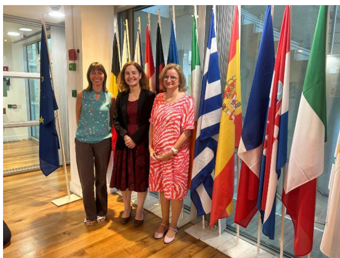
AFE Director Meeting with the EU Ambassador to Tanzania