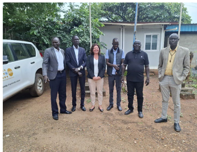
South Sudan National Bureau of Statistics staff

Real Sector Statistics: The National Bureau of Statistics (NBS) received technical assistance in improving the national accounts data for GDP using the expenditure approach, review of experimental GDP by production approach as well as obtaining an update on the plan for the rebasing of national accounts data.