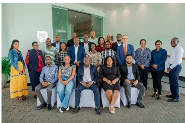
TSA workshop. Arusha, Tanzania. September 22 - 26, 2025.

Participants recommended establishing dedicated TSA units within government agencies, enhancing budget credibility, fostering political and donor support, providing comprehensive training and capacity-building programs, developing standardized TSA manuals, and strengthening cash management strategies alongside cash flow forecasting capabilities.