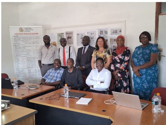
Malawi National Statistics Office staff with AFE Resource persons

Real Sector Statistics: Malawi's National Statistical Office (NSO) was assisted in developing quarterly national accounts data for Gross Domestic Product (GDP) using the production approach, planning for the next rebasing project, and creating/developing a backcasting model for GDP by expenditure approach.