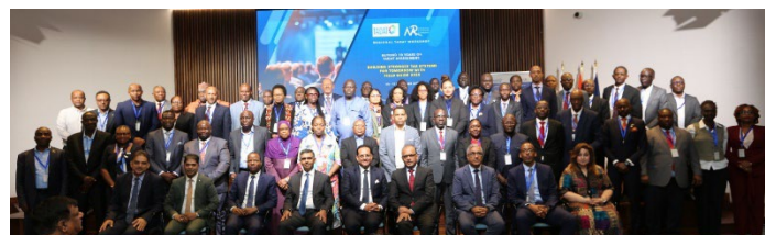
TADAT workshop. Port Louis, Mauritius, September 8 - 12, 2025

Building Stronger Tax Systems for Tomorrow utilizing the Tax Administration Diagnostic Assessment Tool (TADAT). The TADAT secretariat, AFE, AFS, Afritac West 2 (AFW2) and the Mauritius Revenue Authority hosted a joint workshop in Port Louis, Mauritius, bringing together 25 countries' heads of revenue administrations and senior tax officials from the three AFRITAC regions. Participants discussed the TADAT's decade-long progress and the changes in the 2025 field guide, presented both global and regional assessment data, and engaged in an interactive exploration of approaches to enhancing tax administration.