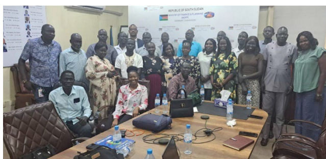
South Sudan Ministry of Finance and Planning staff

Public Finance Management: AFE supported the Ministry of Finance and Planning to improve the macro-fiscal forecasting tool's capabilities to produce forecasts that will guide the 2026/27 budget. Hands-on training was provided to 32 MoFP's officials on the basic theory and concepts of macro-fiscal forecasting and analysis.