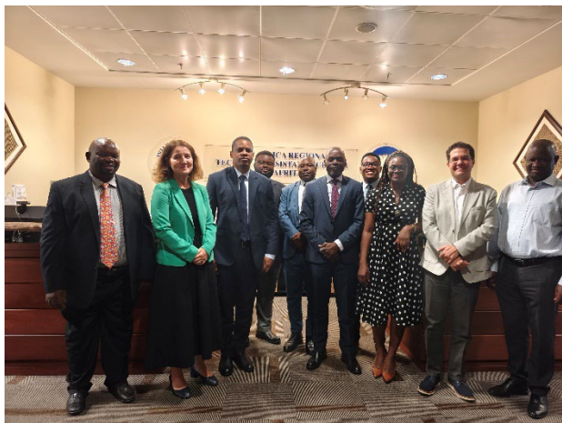
TRA delegation, AFE Director, RA Advisors and Tanzania's IMF Resident Representative