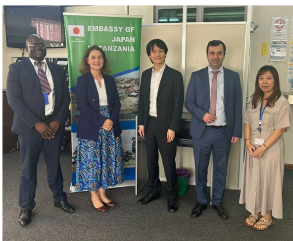
Meeting between AFE and Japan Embassy delegation

In August, the Center Director and the Japan financed advisors in AFE visited the Embassy of Japan to discuss about AFE capacity development work and future areas of cooperation.