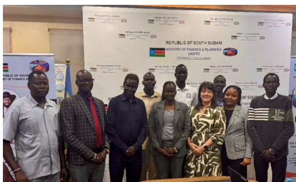
South Sudan GFS Technical Working Group (from Ministry, from BoSS and the Statistical Bureau)

Government Finance Statistics: AFE supported the South Sudan authorities in organizing and validating their revised fiscal data for FY 2023/24 and worked to strengthen institutional collaboration to improve fiscal reporting. This effort aims to enhance data quality and promote better coordination among key stakeholders for more transparent and reliable fiscal statistics.