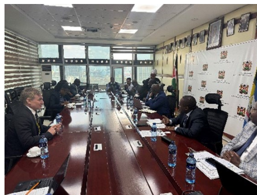
Participant during the GFS Training

Government Finance Statistics: AFE provided support to Kenya to enhance the quality and consistency of fiscal statistics by reviewing fiscal data of the general government. The mission also strengthened capacity for improved compilation and reporting by delivering training on core GFS concepts to the GFS Technical Working Group,