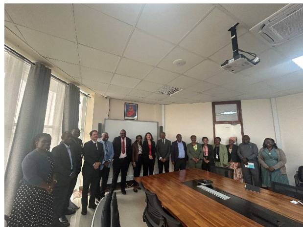
MoF delegation, AFE Director, PFM Advisors and Tanzania's IMF Resident Representative

In August, the Center Director and public financial management advisors visited the Tanzania Ministry of Finance in Dodoma.