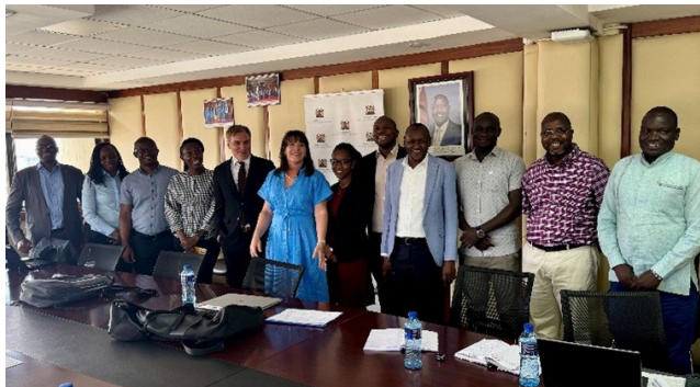
Tanzania GFS compiler visiting Kenya counterparts

Government Finance Statistics: Peer learning was a central component of the recent TA mission to Kenya, where a GFS compiler from Tanzania participated in the sessions to share practical experience with the Kenyan team. This exchange fostered mutual learning as both teams discussed challenges, shared solutions, and collaborated throughout the mission. The engagement strengthened regional knowledge-sharing and underscored the value of cross-country collaboration in improving GFS compilation.